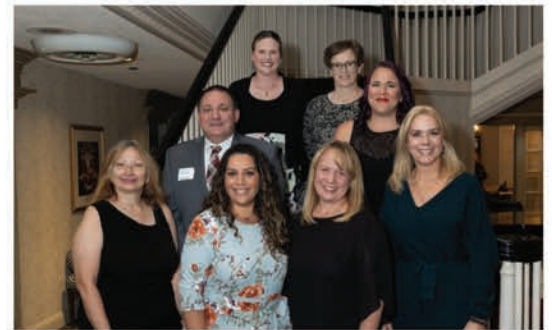
2023 Annual Awards Ceremony volunteers