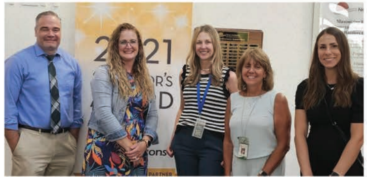
Oakland Community Health Network (OCHN) visits the Auburn Hills Branch