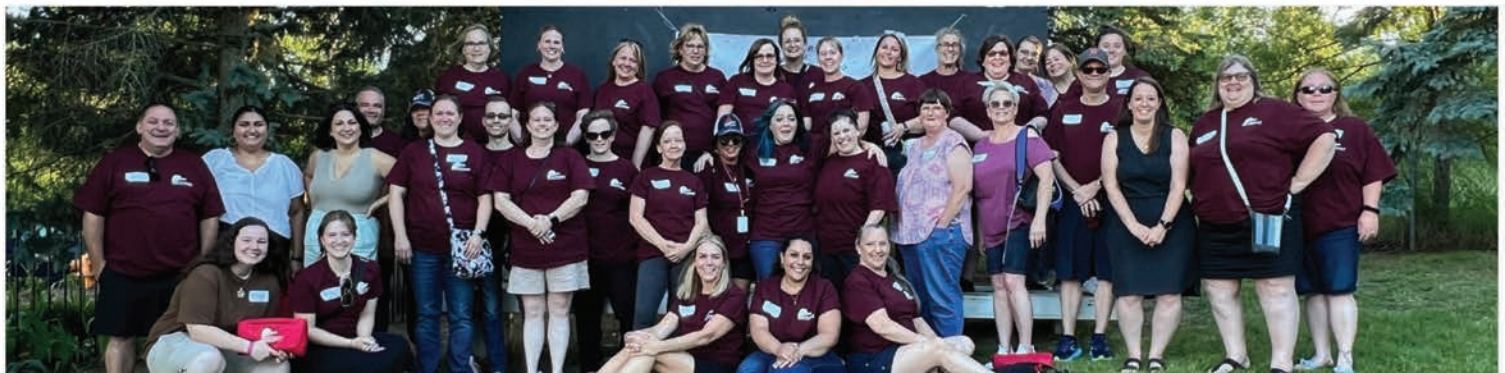
2024 Staff Appreciation Event at Oakland Yard Athletics