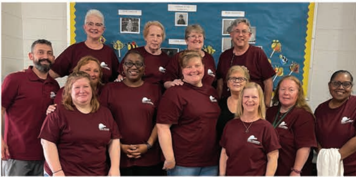
Novi staff at their agency Open House