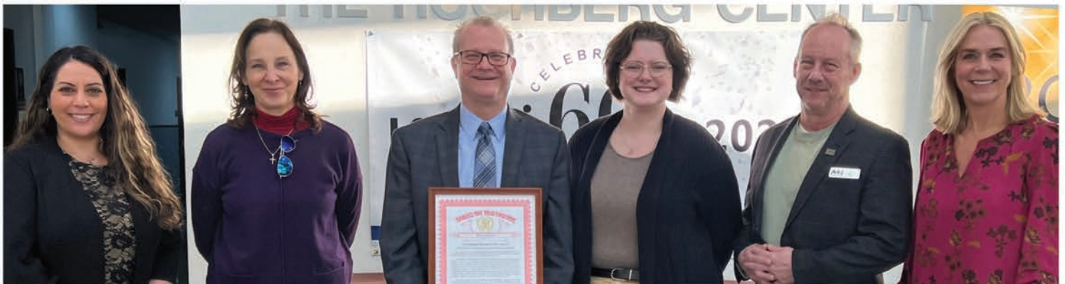
New Horizons presented with a State Tribute from Governor Gretchen Whitmer in honor of reaching our milestone 60 th Anniversary