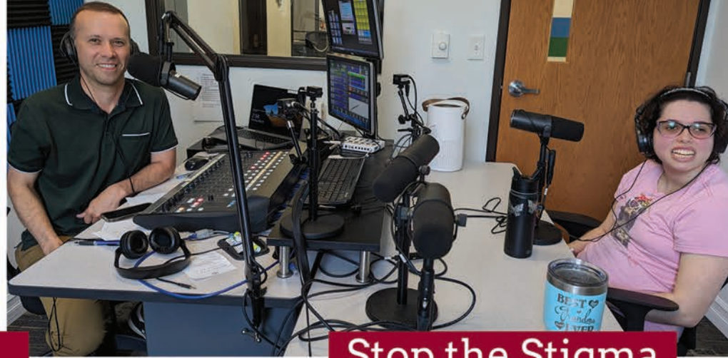
Stop the Stigma