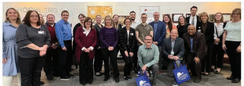
New Horizons hosted the annual Project SEARCH Mock Interviews at their Auburn Hills branch