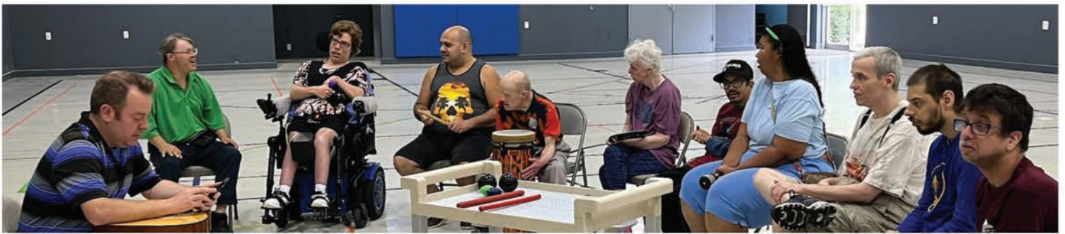
Individuals served enjoying music and companionship during their FAR Music Therapy class