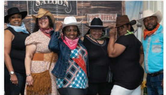
Charity Auction guests enjoying the country western-themed fundraiser